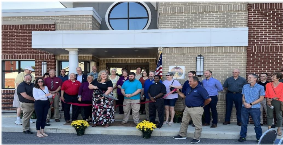
PICTURED LEFT: RIBBON CUTTING CEREMONY FOR OUR MONROEVILLE MUNICIPAL COMPLEX.