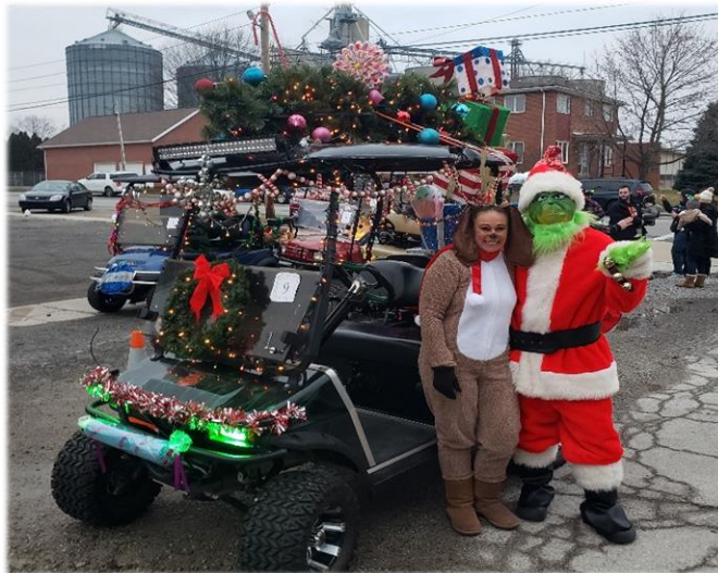
PICTURED BELOW: THE MAYOR'S INAUGURAL DECORATED GOLF CART PARADE.