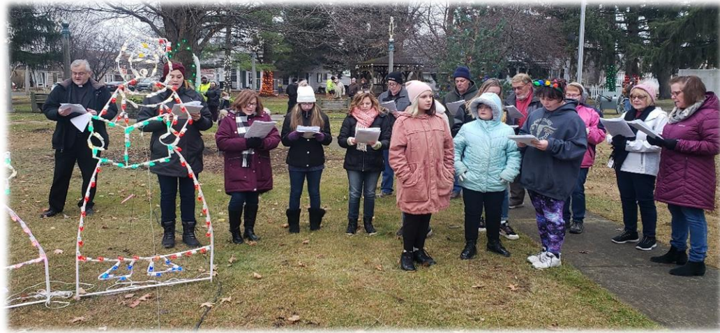
PICTURED ABOVE: CHRISTMAS CAROLERS AT OUR VILLAGE CHRISTMAS-IN-THE-PARK.